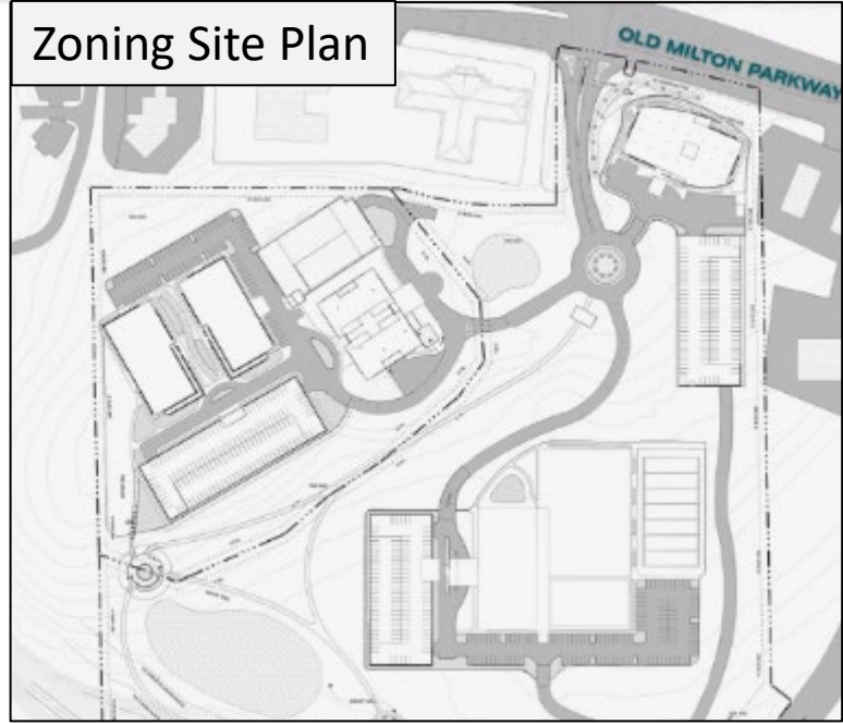
Zoning Site Plan